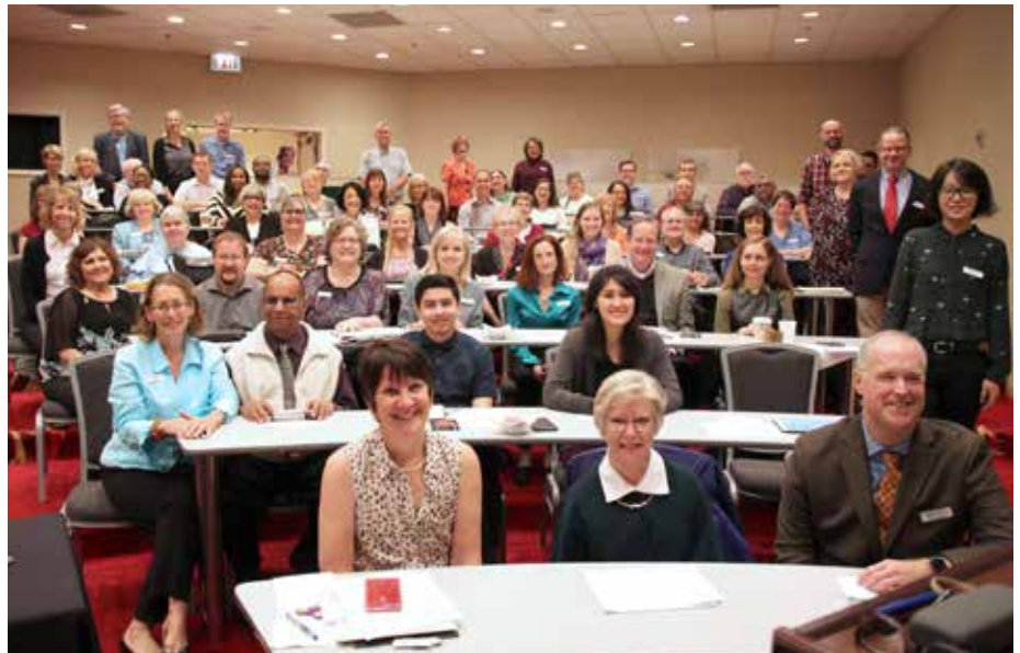
Hadley Staff, 2018 Annual Meeting